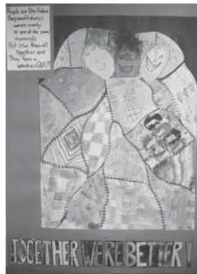
Winning 2007 Poster

We try our best to include each other each day. We know that when you exclude you can make someone feel bad and when you include you can make someone glad."