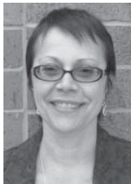
Education Partnership Initiative, The Arc Northern Chesapeake Region – Harford County

Presented to an individual or organization that has distinguished itself through a significant programmatic activity benefiting citizens with cognitive and developmental disabilities in Maryland.