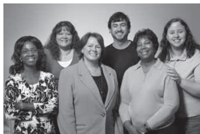
The Arc of Howard County Light Enhancement Program