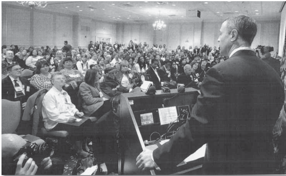
Governor O'Malley at DD Day at the Legislature