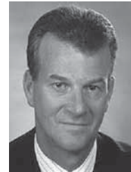
The Honorable James Hubbatd